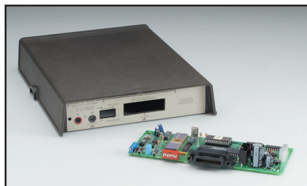
Model 5802: Isolated analog output/IEEE-488 interface for Model 580 (cover included).